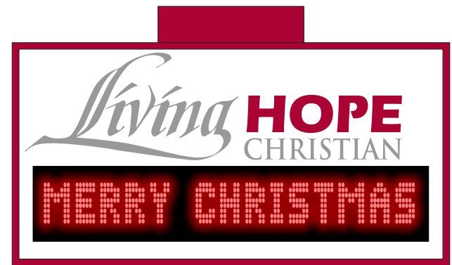
4x8 B Face LED

Choose from one of our standard placement options to the right, or use a custom placement. Call for Pricing on the configuration that best fits your Churches needs